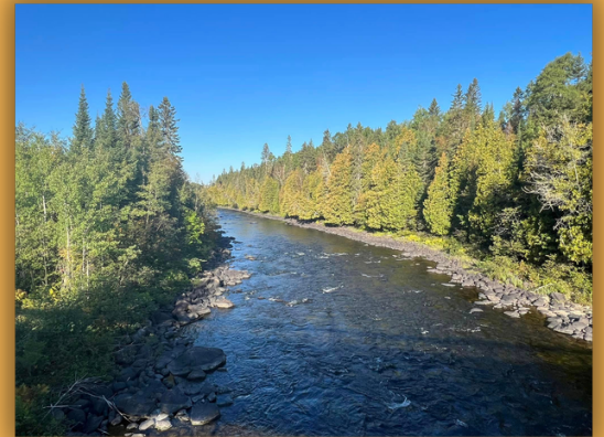
White River flows through the community nestled on White Lake